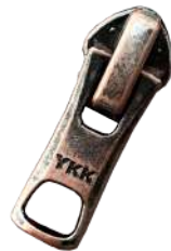
Abrasion Slider finish