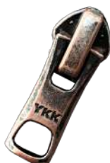
Abrasion Slider finish Code: RLV